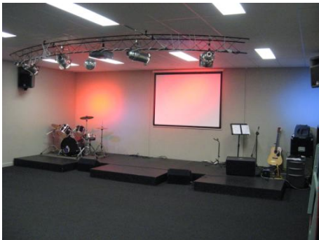
Meeting Rm 1 -Small Aud.

Suitable for 20 theatre style seating or 18 at training tables. (no food or drinks) Seating on high quality ergonomically designed chairs. White Board. Carpeted floor. 42 inch flat screen television with screen display tech support for DVD; Digital Television; Fully Air-Conditioned.