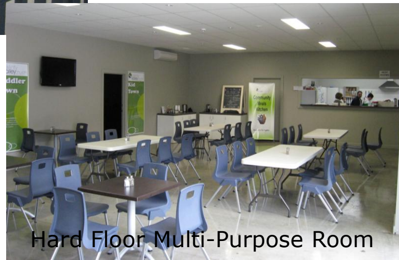
Hard Floor Multi-Purpose Room