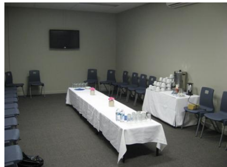
Meeting Room 2