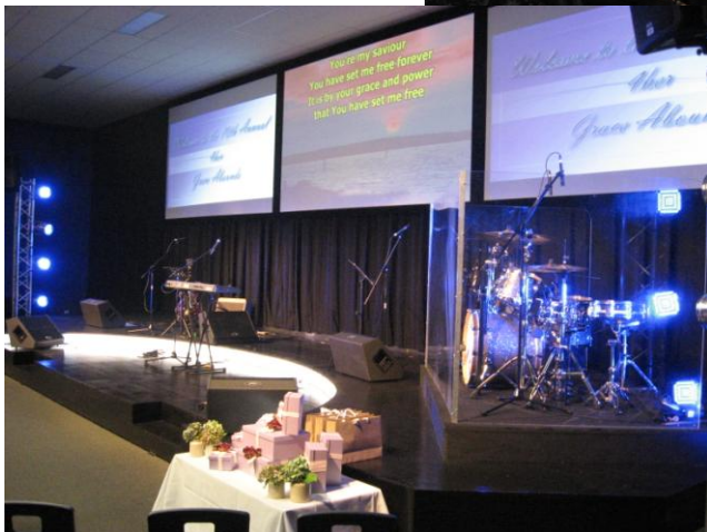
Stage - 2 level with LED lighting